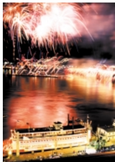
Thunder Over Louisville

Join Kentuckiana and your SACUBO friends on Saturday, April 15, in the opening ceremonies of the 2000 Kentucky Derby Festival. This spectacular fireworks display draws an average of 600,000 annual spectators and has been the largest show of its kind in America for the past nine years. The year 2000 Thunder is expected to top all previous versions and will begin at 9:30 P.M. The day's festivities take place on the Louisville Waterfront, which is a very short walk from the Galt House hotel. Don't miss the opportunity to take part in this great day in Louisville! To view some clips from previous Thunder events visit the Kentucky Derby Festival web site at www.kdf.org .