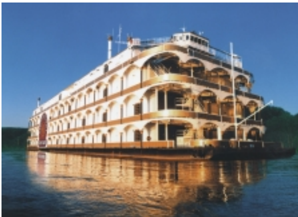
Caesars Riverboat Casino

more than 15 years ago when she was the first lady of Kentucky. Their mission is to promote the continuation of regional arts and crafts by encouraging the artist to teach their skills to the next generation and by helping the artists sell their products. Every item in the gallery has been juried. For more information on Locust Grove, visit their web site at www.locustgrove.org