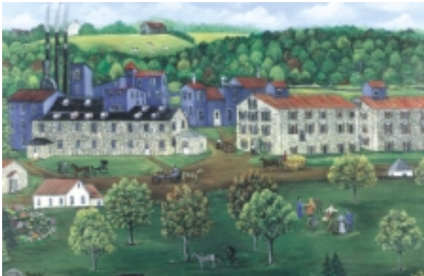
Labrot & Graham Distillery