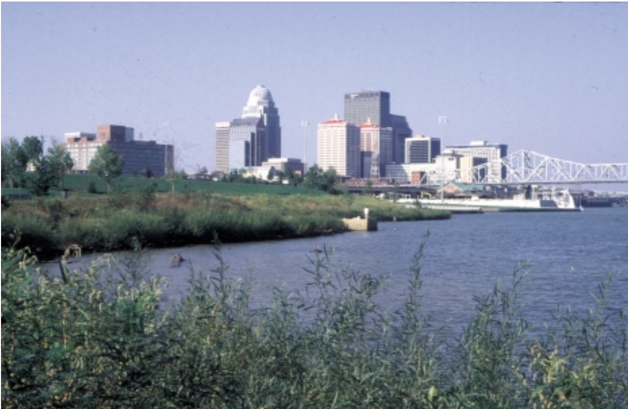
Louisville Waterfront Park

Visit Louisville on the Internet at www.louisville.com .