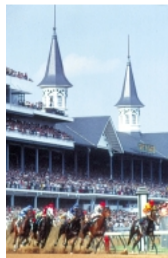
Churchill Downs www.kentuckyderby.com